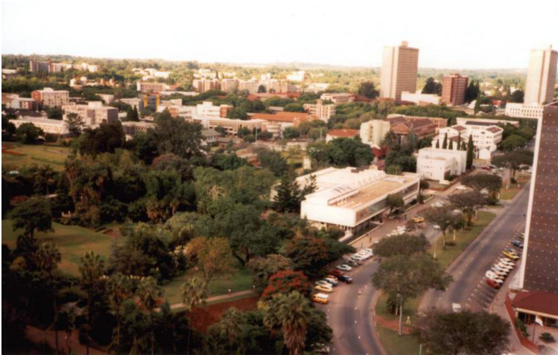
Fig. 8 for Question 6